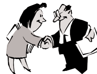
Table B5 Submission of LDP for Examination

all relevant supporting information and representations to the WAG for its Examination.